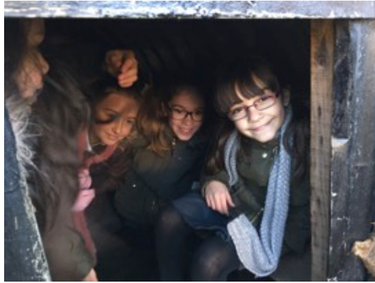
Year 6 learned first-hand about World War 2: riding in a jeep, being crammed into a damp Anderson shelter and the importance of 'Grow Your Own'.